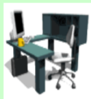
FURNITURE AND FIXTURES