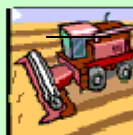
MISCELLANEOUS AND FARM EQUIPMENT